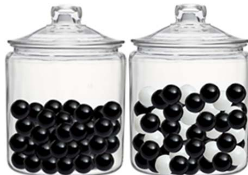
Figure 3: Visual representation of Low Entropy (Left) and High Entropy (Right)

Shannon Entropy produces a number that captures the amount of certainty or uncertainty present in a specific time series or series of events. The differences between certain (rigid) and uncertain (flexible) states can be visualized using two jars of marbles. For example, in Figure 3, the jar on the left contains only black marbles. Thus, if you were to take a marble out of the jar (without looking), you would be very certain that the marble you choose would be black. This results in low Entropy, where the next choice in a series is highly predictable and certain (i.e., rigid). Conversely, the jar on the right contains both white and black marbles. Thus, if you were to pull blindly from the jar, you would be less certain of the colour of marble you would pick. Indeed, in this jar, the marbles are mixed and distributed unevenly. Thus the predictability of what comes next would be low, resulting in a high Entropy score (i.e., flexible).